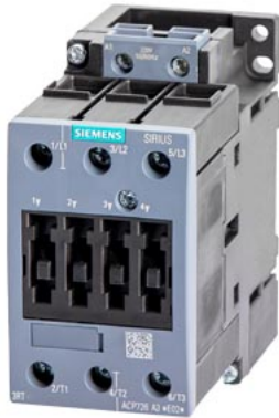
Contactora AC 110 V 50/60 HZ AC3 18,5 kW 400 V 3 pole, mod. S2 screw terminal